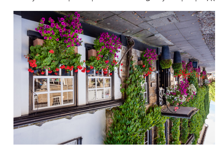
gnitos bno gniqqods

Woodstock is a fine Georgian town with an eclectic mix of art & antique shops and specialist independent businesses where the visitor can find that truly unique gift. When you've finished shopping then pop into one of the excellent pubs, restaurants and coffee shops to taste locally sourced produce.