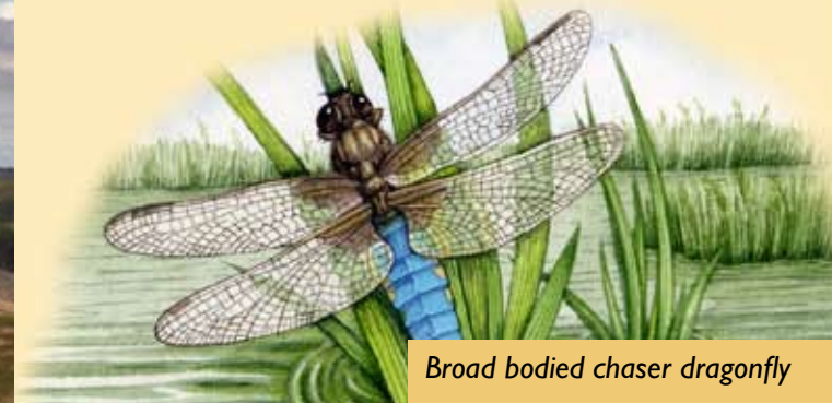
Broad bodied chaser dragonfly

The spoil heaps from the abandoned lead mines have been slowly reclaimed by nature and the mine reservoirs are home to a variety of aquatic plants and animals.