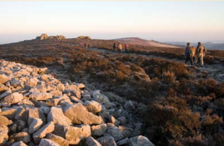
The Stiperstones skyline

The Stiperstones area is a stunning landscape. It has dramatic and wild scenery, sheltered valleys with villages and hamlets linked by narrow country lanes. The area is steeped in history and folklore - there are ancient cairns, hill forts and historic lead mines as well as spine-chilling tales of The Devil, Wild Edric and local witches. It is also a haven for wildlife and includes The Stiperstones National Nature Reserve. Look out for magnificent birds of prey, delicate wildflowers and some of the oldest holly trees in Europe.