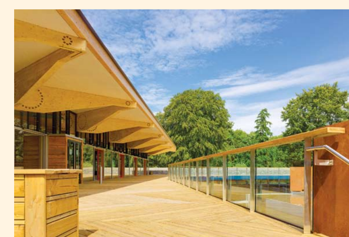
G John Hope Gateway – new visitor facilities and a showcase for biodiversity and the global work of the RBGE