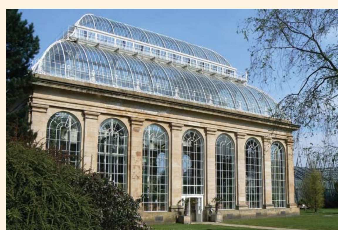
16 Victorian Palm House and entrance to the Glasshouses