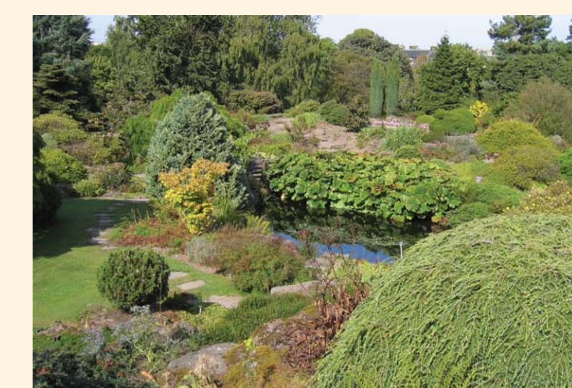
20 The Rock Garden – home to over 4,000 mountain plants from across the globe