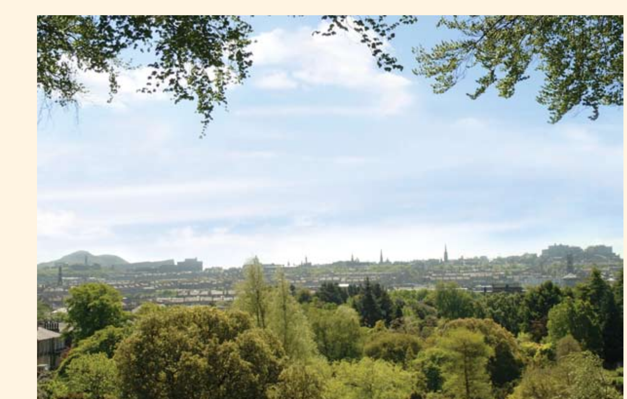
7 City Viewpoint – a panoramic view across the New Town to the heart of the city

Please respect the Garden and the enjoyment of others