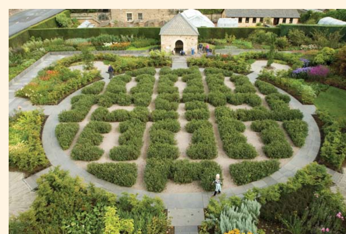
19 Queen Mother's Memorial Garden – a living tribute to a much-loved Monarch