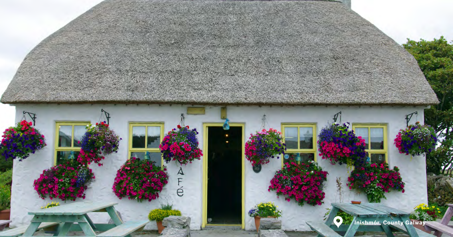
Inishmór, County Galway

fiddles get going, it can seem like a scene out of a John Ford movie.