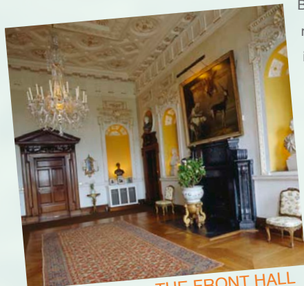
THE FRONT HALL