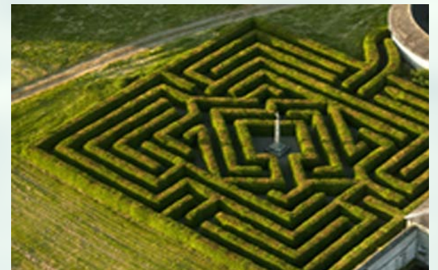
THE FAMOUS 7 FOOT HIGH BEECH HEDGE MAZE

Every Sunday and Bank holiday in April Every day in May, June, July, August & September Every Sunday and bank holiday in October Open on all other days by prior appointment.