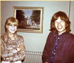
Mick Jagger & Marianne Faithfull Russborough 1965

Fred Astaire - Russborough 1977 extensive vinyl record and sheet music collections from the 1920's onwards are also on display. Part of the Exhibition is also devoted to previous owners, local history stories about Poulaphuca reservoir and the Blessington Tramway.