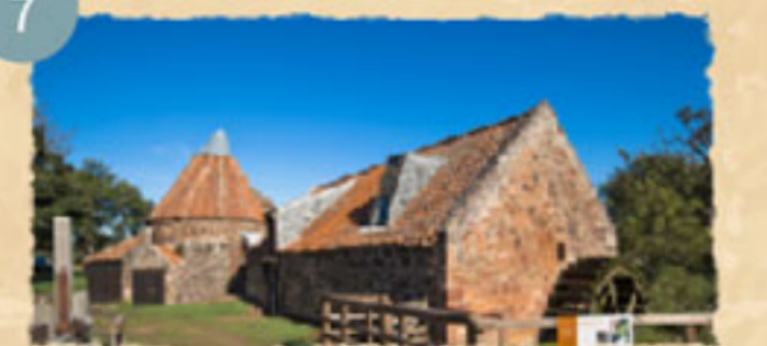
Preston Mill - East Lothian Season 1

P Originally designed by one of Scotland's greatest architects, Robert Adam, the grounds that surround this lavishly decorated house doubled as the Palace of Versailles in France (S2) and Helwater and Ellesmere (S3). Note: part of the grounds is available for public use, but the house is only open for visiting on certain days. Please check before you travel. Longniddry, EH32 0PY www.gosfordhouse.co.uk