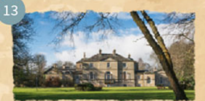
Gray Buchanan Park - Falkirk Season 4

P Located between Linlithgow and Falkirk, the park lent its backdrop to the dramatic Battle of Prestonpans, and doubled both as a British encampment and the English countryside. Open All Year. Whitecross, EH49 6LW www.falkirkcommunitytrust.org.uk