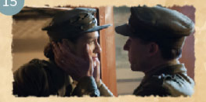
Bo'ness & Kinneil Railway - Bo'ness Season 1