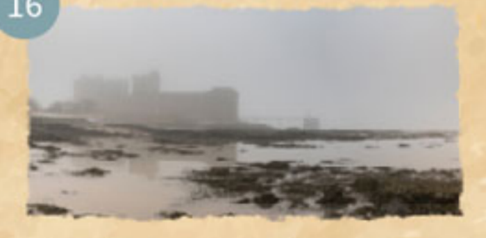
Blackness Castle - By Linlithgow Seasons 1 & 2

P The Bo'ness & Kinneil Railway was transformed into a wartime London railway station where Claire and Frank said their goodbyes. Tour this heritage railway and explore Scotland's largest railway museum, before taking the chance to board a preserved vintage steam or diesel-hauled train. Open Mar - Oct. Bo'ness Station, EH51 9AQ www.bkrailway.co.uk