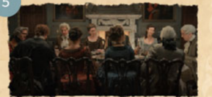
Newhailes House - East Lothian Season 4

P The ruined medieval castle of Craigmillar became Ardsuir Prison, the place of Jamie's incarceration. Visit the castle to admire the views across Edinburgh. Interesting fact: Mary Queen of Scots used the castle as a safe-haven in 1566. Open All Year. Edinburgh, EH16 4SY www.historicenvironment.scot