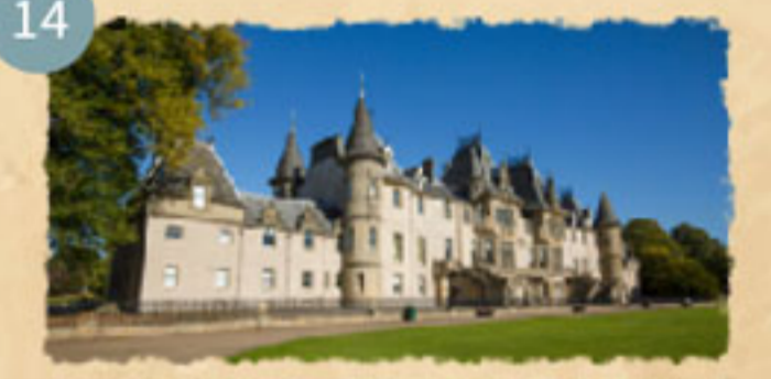
Callendar House - Falkirk Season 2

P Known locally as Parkhill, the site has pretty woodland areas alongside the meandering Polmont Burn, and large rolling parkland areas with mature tree avenues. This is where Jamie and Young Ian buried Gavin Hayes after he was hanged for stealing in Charleston, South Carolina. Please note there is no graveyard in the park. Polmont, FK2 0XR www.falkirk.gov.uk