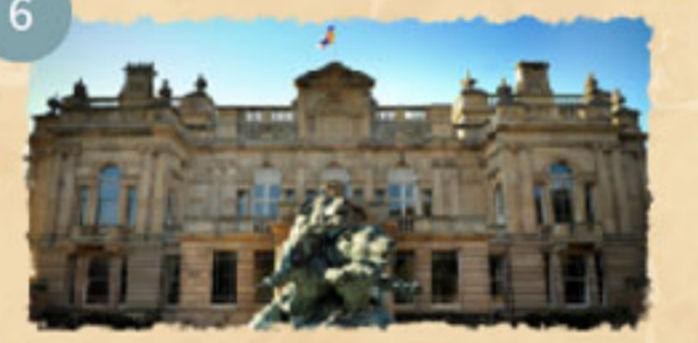
Gosford House - East Lothian Seasons 2 & 3

P Located just a few miles east of Edinburgh, this 17th century Palladian villa served as Governor Tryon's home in North Carolina, where Jamie discussed the offer of a land grant in exchange for service to the English Crown. Newhailes also featured when Jamie and Claire were introduced to Wilmington Society. The house is currently closed for restoration work, but Newhailes Estate is open to the public all year and offers nature walks and unspoilt views of the house and across the Forth. Muselburgh, EH21 6RY. www.nts.org.uk