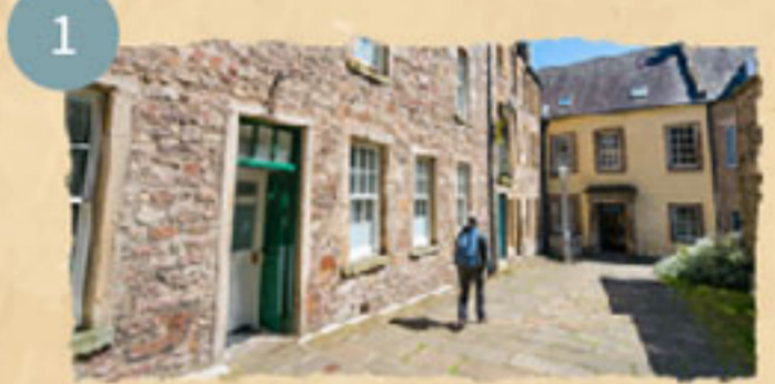
Tweeddale Court - Edinburgh Season 3

Delve into the world of Outlander and discover the locations which featured in the hit TV series. From Castle Leoch to the North Carolina wilderness, follow this map and explore for yourself the Scottish sites that were used in filming Claire and Jamie's adventures.