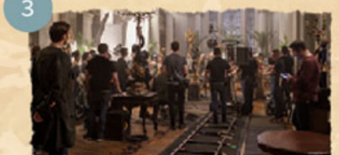
Signet Library - Edinburgh Season 3

P Bakehouse Close just off Edinburgh's Royal Mile was the setting for Jamie's Print Shop and where Claire reunited with Jamie after years of separation. This is one of the best-preserved closes in the city and was transformed into 18th century Edinburgh for exterior shots of the Print Shop. Why not visit the fascinating Museum of Edinburgh next door. Edinburgh, EH8 8DD www.edinburghmuseums.org.uk