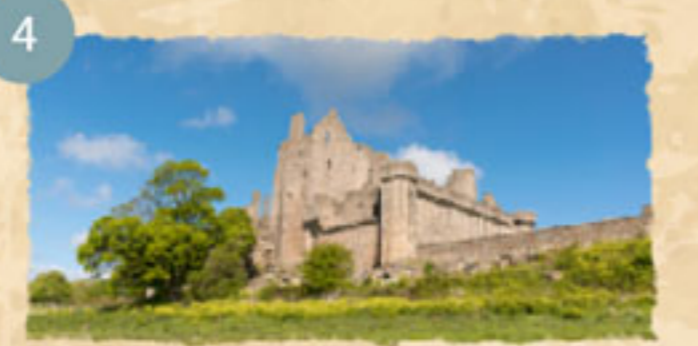
Craigmillar Castle - Edinburgh Season 3

P The stunning interior of the Signet Library in Edinburgh's Old Town was transformed into the Governor's Mansion in Jamaica. The library is home to the prestigious Society of Writers to Her Majesty's Signet which dates back to the 15th century. The library is not open to the public but the 'Colonnades' are open all year for lunch and afternoon tea. Edinburgh, EH1 1RF www.thesignetlibrary.co.uk