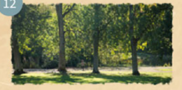
Muiravonside Country Park - Linlithgow Season 2

P The entrance and corridors of this ruined palace were used as Wentworth Prison where Jamie was imprisoned. Once a favoured royal residence of the Stewart kings and queens and the birthplace of Mary Queen of Scots, this wonderful 15th century site, with its elegant courtyard, still oozes charm. Open All Year. Linlithgow, EH49 7AL www.historicenvironment.scot