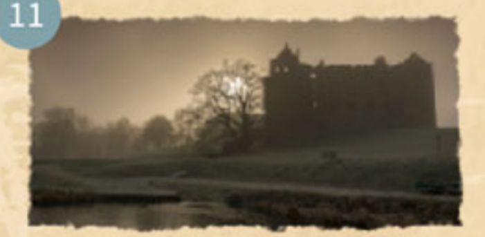
Linlithgow Palace - Linlithgow Season 1

P Situating near the town of Linlithgow, this 913-acre country park is a great place for enjoying the countryside and visiting the red deer and Highland cattle at the animal attraction. Have fun at the play area or stay for longer at the caravan & camping site. The park doubled as the North Carolina wilderness which Jamie and Claire rode through after leaving River Run. On the journey through the forest, they became separated during a thunder storm and Claire was haunted by the ghost of Otter-Tooth. Linlithgow, EH49 6PL www.westlothian.gov.uk