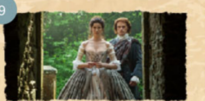
Glencorse Old Kirk - Penicuik Season 1