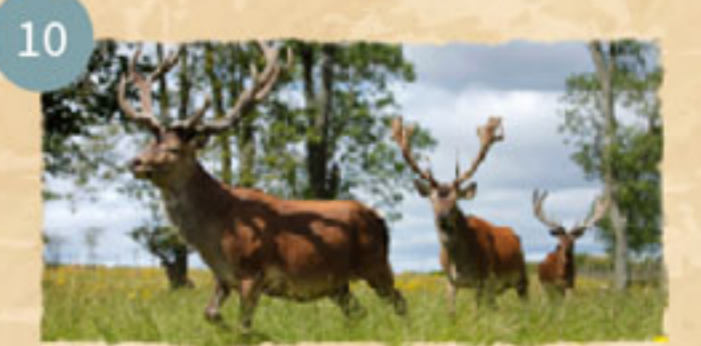
Beecraigs Country Park - West Lothian Season 4

P Situating near the town of Linlithgow, this 913-acre country park is a great place for enjoying the countryside and visiting the red deer and Highland cattle at the animal attraction. Have fun at the play area or stay for longer at the caravan & camping site. The park doubled as the North Carolina wilderness which Jamie and Claire rode through after leaving River Run. On the journey through the forest, they became separated during a thunder storm and Claire was haunted by the ghost of Otter-Tooth. Linlithgow, EH49 6PL www.westlothian.gov.uk