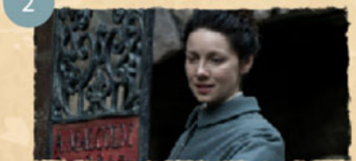
Bakehouse Close - Edinburgh Season 3

P The hustle and bustle of the market where Claire is reunited with Fergus was filmed here. The entrance to this time capsule of a street is from the historic Royal Mile. Take time to explore one of the oldest parts of Edinburgh. Edinburgh, EH1 1TE www.ewh.org.uk