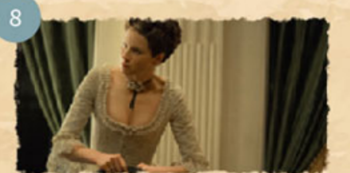
Arniston House - Midlothian Season 4

P In the village of East Linton is the picturesque Preston Mill - one of the oldest working, water-driven meal mills in Scotland. It provided the backdrop for several scenes during the Jacobite Uprisings. Tour the mill to see the mechanisms in action and learn about its history and the people who lived and worked there. Open May - Sept. East Linton, EH40 3DS www.nts.org.uk