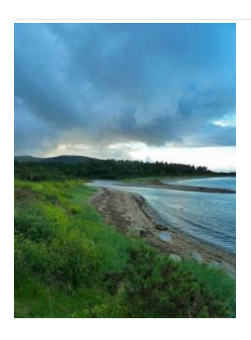
Sannox Bay - Sannox