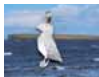
Hand engraved Puffin pendant