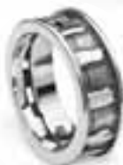
Ring of Brodgar