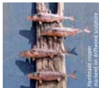
Handmade copper mackerel on driftwood sculpture