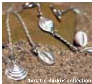
'Groatie Buckie' collection