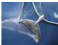
Bottlenose Dolphin Fluke