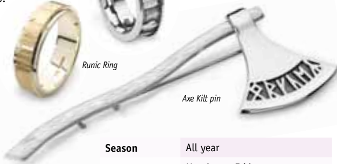
Axe Kilt pin