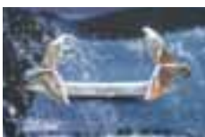
Unisex Humpback Bangle