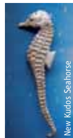
New Kudos Seahorse